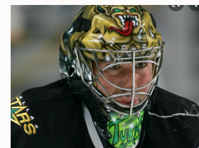
All-Time most winning goalie in Dallas history