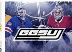
GGSU is a gigantic hockey hub with thousands of reach