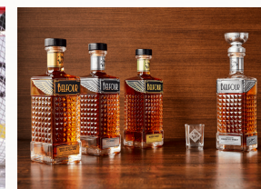
He and his son decided to go into business together