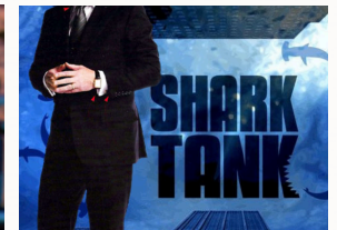
Kevin Brings Credibility from His Show: Sharktank