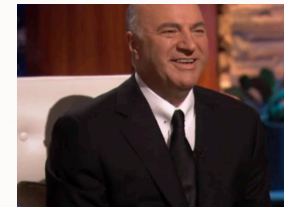
O'Leary is a World-Renown Venture Capitalist