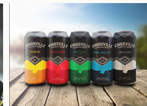
Owns a very popular brewery and beer brand