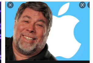
Apple is the wealthiest businesses in the world