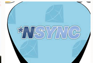
N'SYNC is a famous 90's boy-band phenomenon