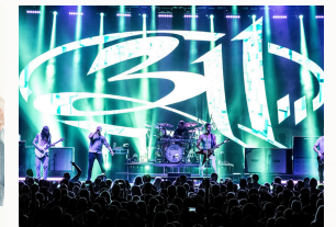
311 is still touring, recently at Red Rocks!